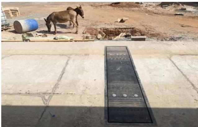
An 4020 low-speed WIM Scale installed at the Sotracom Aggregate Facility

For this reason, they selected IRD's low-speed WIM system to measure vehicle weights before they depart Sotracom's aggregate facility, ensuring conformity with regulatory requirements and avoiding costly fines. Objectives of enforcement regulations in Senegal are to reduce the risk of accidents and prevent premature degradation of roads that costs billions in CFA francs each year to remediate. The onus is put on private companies to monitor their vehicle weights and ensure they are within the permitted maximum weights.