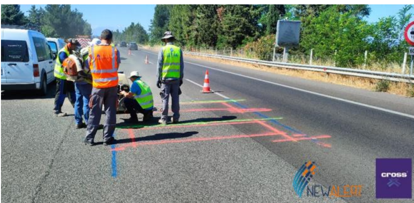
Sensor installation in Greece

Every single installation was finalised with extensive training for final operators to be able to operate and maintain the system properly. The installations were realised on state roads with respect to the surrounding nature, citizens, and highway users. The solution has been proposed to measure all vehicles and especially to inform the operator about every dangerous overloaded vehicle.