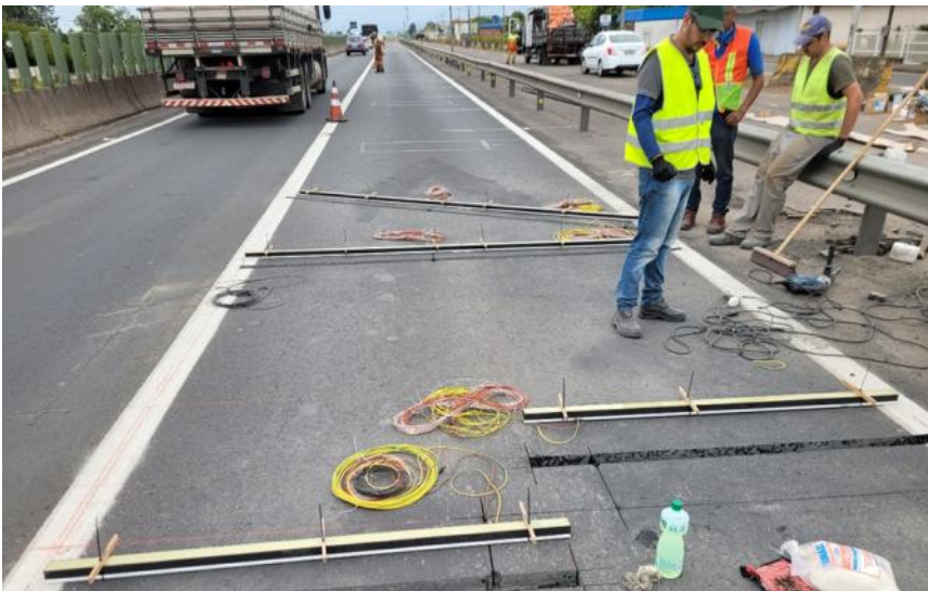
Installation of the CAMEA HS-WIM on the BR-101 highway.

The research project aims to propose the creation of standards (or the review of existing standards) through studies on sensor technologies, systems, and aspects of road operation related to automated monitoring and also to promote the development and modernisation of the levels of intelligence of the processes currently in place. The CAMEA HS-WIM site uses 6 total sensors (4 sensors + 2 tilted for vehicle position) per lane. The same setup with which CAMEA received the OIML 10F certification in 2023.