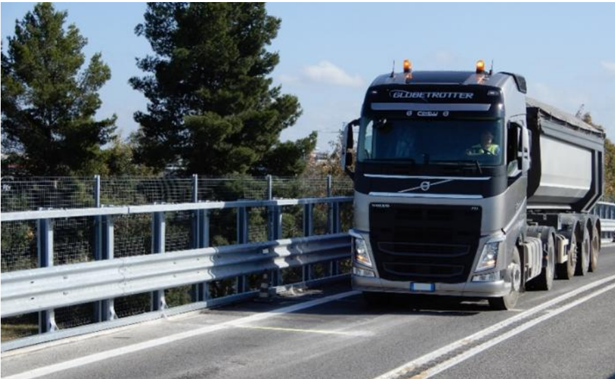
HS-WIM with two strain gauge strip sensors in staggered layout

While Autostrade operates its own HS-WIM sites, the data is accessible to enforcement authorities. They can log into the system to understand the overloading situation and take appropriate action. By focusing on transport operators with a history of frequent and severe overloading violations, Autostrade and enforcement officials can be more effective in their control strategies.