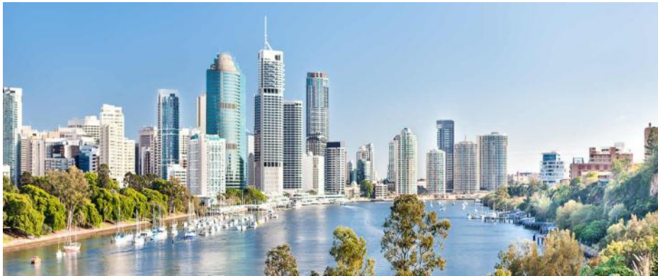
View of Brisbane, Australia.