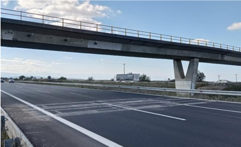
One of the 20 WIM systems installed by CROSS in Greece

From the end of the year 2019 until January 2023, CROSS Zlín, a.s. has installed twenty WIM stations in the regions of Greece. The final users are several Greek municipalities like Nea Odos, Egnatia Odos, Olympia Odos and Aegean Motorways. Thanks to CROSS's very appreciated local partner and system integrator NewAlert and their highly experienced employees, they have, under CROSS' supervision, installed and calibrated all of the High-Speed Weigh in Motion systems. The systems meet strict local demanding criteria and ensure accurate measurement results for pre-selection purposes.