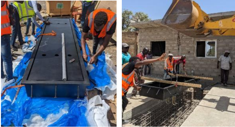
Unpacking the WIM Scale and Installing it at the Facility Entrance

Sotracom is a construction company based in Senegal that requires a weight compliance solution to meet regulatory requirements and ensure their vehicles operate within legal weight limits. A single platform static scale was unsuitable for this application as axle weights are required by the regulations.