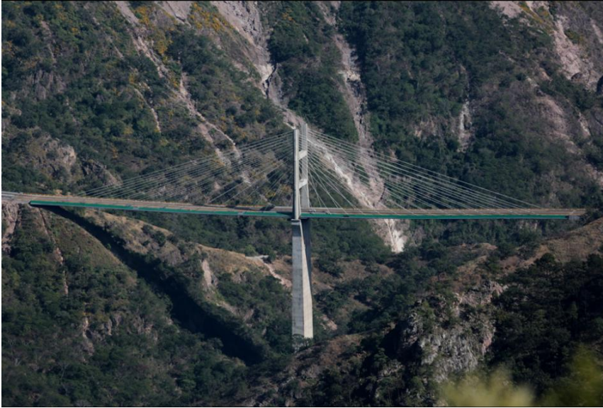
El Carrizo Bridge in Mexico.

Two checkpoints with Weigh In Motion (WIM) technology have been installed in summer 2018. The location of the sensors was determined to be before the toll stations that surround the bridge so they can pre-select the heavy vehicles and have enough space to detour those vehicles from the bridge itself. The trucks – both with and without trailers – are traveling on the bridge at average speeds of 90 km/h.