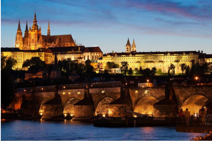
Night view of the old city of Prague, Czech Republic

ISWIM will appoint a chairperson among its members for each workshop the chair will briefly introduce the topic, introduce the speakers, take care of the time and lead the discussion. A session secretary will take notes and prepare a short synthesis of the session, to be published after the conference on the ISWIM web site. At least 15 minutes will be reserved for questions and answers.