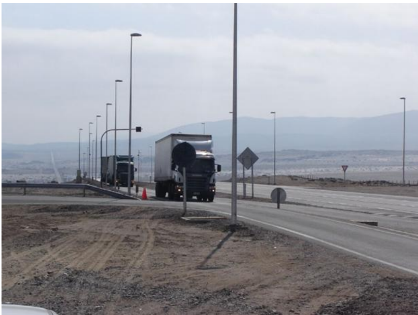
Commercial vehicle crosses the first of two WIM scales

International Road Dynamics (IRD) subsidiary PAT-Traffic Ltda. installed the first 13 weigh stations in Chile in 1982 and 1983. Since then, these weigh stations have operated 24 hours a day, only closing for maintenance. Today there are 35 PAT Traffic installed and serviced weigh stations using weigh in motion (WIM) across the country. The use of WIM has reduced overloading, increased pavement life, and reduced accidents that involve heavy trucks.